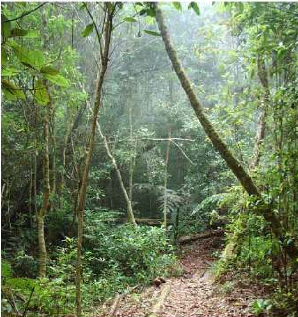
A trail in the cloud forest of Honduras

It has been noted by many authors that temperate forests are more diverse with mycorrhizal fungi than tropical jungles. During this outing, only a single Amanita was found, something in the Section Vaginatae and something that was also riddled with insects. Besides the Indigo Milkcap, only one other species of milk cap