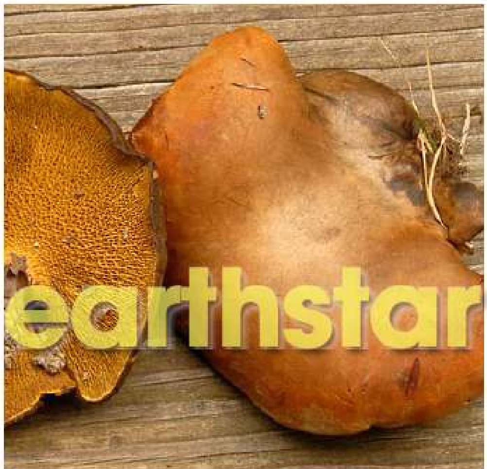
Asb tree boletes