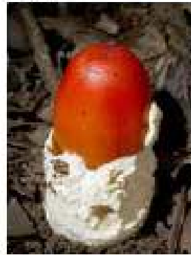
A very young Amanita Jacksonii, American Caesar