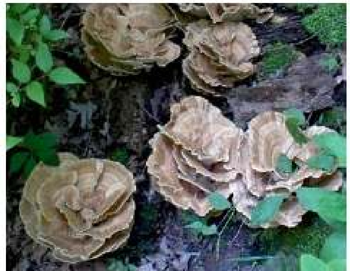
Polyporus berkeleyi or Berkeley's polypore