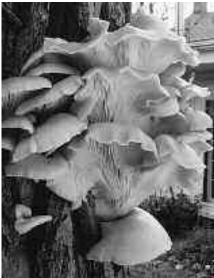
Oyster mushroom