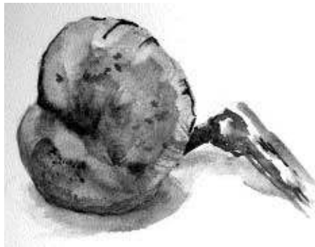
Mushroom sketches were painted during last year's Sweat 'n Chanterelles by Earthstar editor Julie McWilliams.

1:30PM-4:30PM Continue hunting or spend some time relaxing, hiking or swimming in