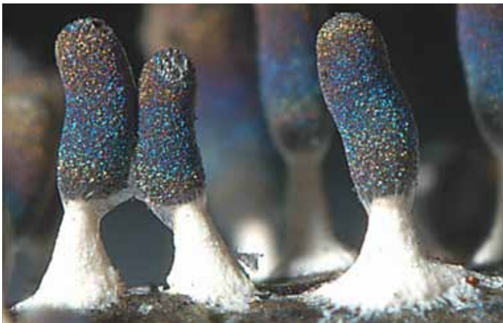
Diachea leucopodia This species was also mentioned in the article.

The white calcareous stalks have a spherical spore case (1 to 2 mm in total height) covered with a brilliant iridescent blue peridium that encloses a black spore mass. Sporangia that often number in the thousands can be seen with the unaided eye on decaying leaf litter mixed with woody twigs on ground sites. Martin and Alexopoulos (1969) on page 180 describes the habitat as "leaves, herbaceous stems, and dead wood" and this is accurate as far as it goes. Fragments of leaves and twigs pasted in a collection box do not give habitat details necessary to predict where D. splendens can be found in the field. Even though this species is not common I have collected it in the states of Georgia, Indiana, Kansas, Missouri, and West Virginia. These collections were all characterized by similar habitats where decaying leaves, twigs, and wood fragments had accumulated in a dry stream bed often in a pile several feet deep. Our collections of D. splendens in Ha Ha Tonka were confined to Black Sink and along dry rivulets about 1 to 2 meters across. These habitats were created as the water washed leaves and twigs into piles that accumulated along different places in the dry streambed. These piles often were wet at the bottom and dry at the top thereby providing ideal conditions for the white plasmodia to develop and increase in size in the lower levels and migrate some distance to the top of the pile to form sporangia where it was drier. A common species found in