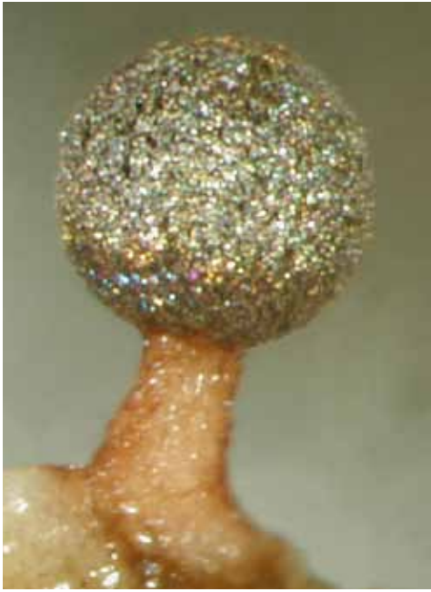
Diachea arboricola , mature sporangium with iridescent peridium exhibiting gold, silver, and colors of the rainbow.

Ha Ha Tonka is D. leucopodia that develops extensive white plasmodia that migrate over great distances to form cylindrical iridescent and white stalked sporangia. I have collected sporangia several feet off the ground on fern fronds, and on the stems and leaves of living plants of poison ivy and stinging nettle. Apparently this myxomycete species is not allergic to poison ivy!