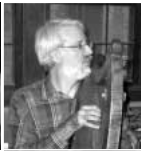
Music for Friday cocktails.